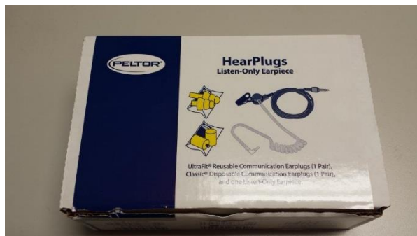
Box label of product NOT under recall